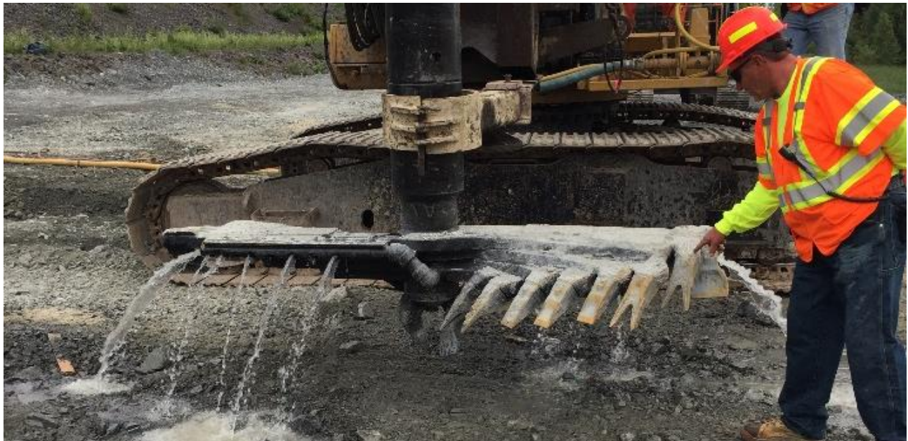
Figure 4. Large Diameter Auger with Grout Ports

Cores were collected using a Sonic Drill Systems 550 track-mounted drill rig and the drilling was performed "dry" (water was not used as a drilling fluid). The recovered core was subject to photo-logging and visual inspection for comparison to the test column cores and to detect evidence of inadequate mixing, such as large clods of clay, or areas without cement.