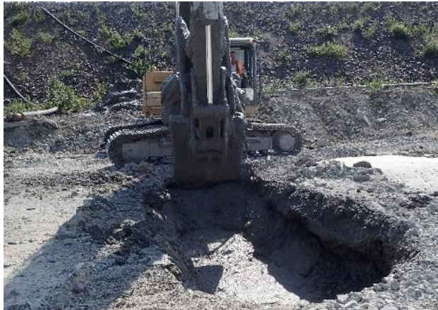
Figure 2. Pre-excitation

Excavation under slurry/fresh spoils continued until the organic material was removed and the clay/silt layer beneath was reached. Backfill material consisted of the segregated inorganic soils from the excavation, soil mixing spoils, and imported make-up granular material provided by the facility. Figure 2 includes a photo of an ongoing pre-excitation cell and Figure 3 shows an example of the organic material removed.