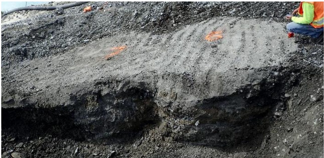
Figure 1. Excavated Test Program Columns

At areas along the dam alignment where a high organic/peat layer was identified, GSI had planned on performing pre-excavation of the organics under a bentonite support slurry. As the project progressed, it became clearly advantageous to reduce the amount of bentonite slurry and instead use excess uncured (wet) spoils/swell from prior columns, to the extent feasible, to improve trench stability. To accomplish this, the pre-excavation excavator operator would reach over into fresh soil mixed material and “spoon” material over into the advancing pre-excavation. This had the additional advantage of reducing excess spoils (“swell”) returned to the ground surface during the mixing process. The cement in the recycled spoils was not credited against (did not