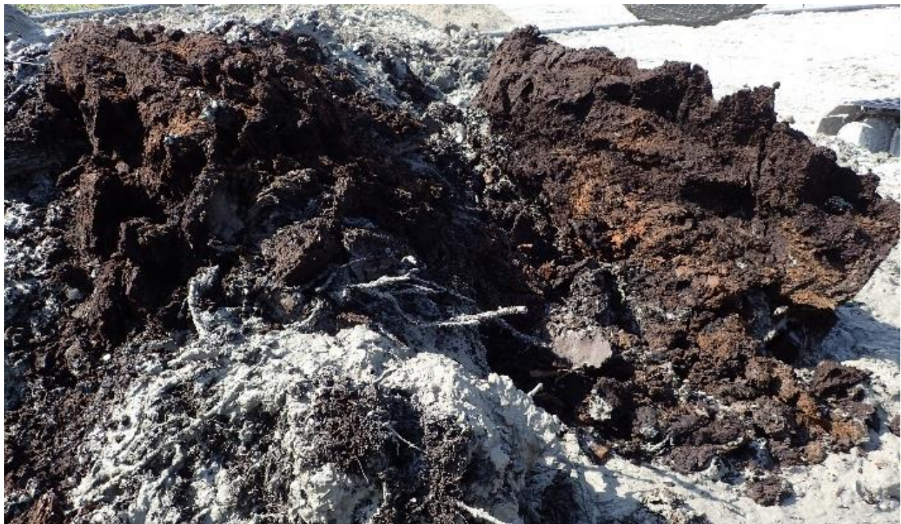
Figure 3. Organic material removed during pre-excitation

The drill rig utilized was a Delmag RH-18, equipped with a 2.59m diameter single flight auger mounted on the end of a hollow stem Kelly bar. The rig and auger were able to introduce grout at the point of mixing through a series of ports on the back of the auger flights. The auger was also outfitted with replaceable cutting teeth which were changed throughout the project as needed, to maintain proper cutting and mixing of the soil. Figure 4 includes a photo of the drill rig and auger used for this project.