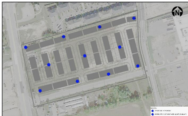
Figure 2. Typical borehole location plan