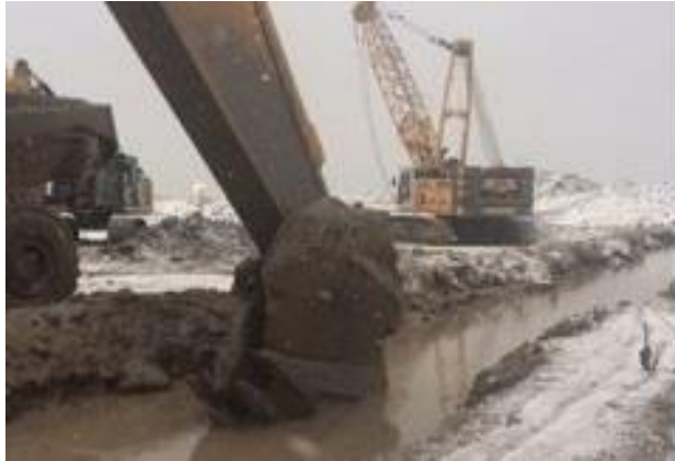
Figure 5. A boulder being removed from the trench with the long stick excavator