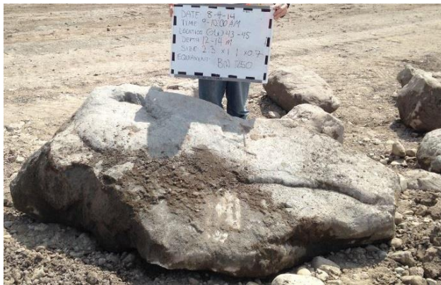
Figure 6. Boulder removed from trench measuring 2.3m x 1.1 m x 0.7m