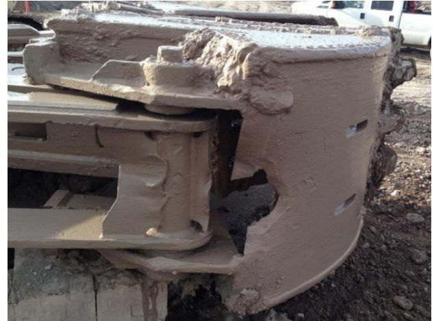
Figure 7. Damage to a clamshell bucket during excavation of boulders