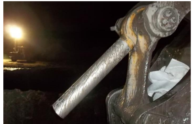
Figure 8. An attempt to remove a boulder from the trench resulted in a broken bucket cylinder on the PC-1250