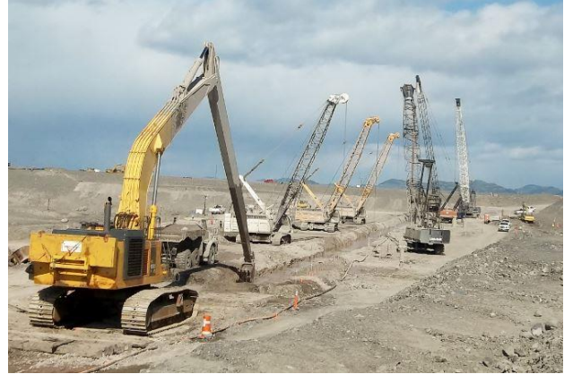
Figure 4. Modified procedure included three clamshells and two drill rigs

The other components of the work, including slurry preparation and maintenance, and backfilling, were performed as planned.