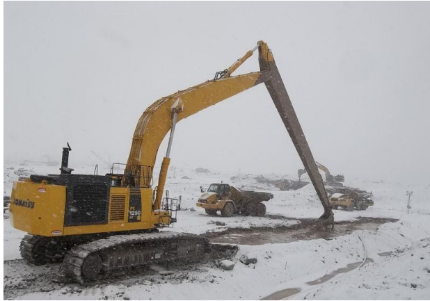
Figure 9. Snowy site conditions during winter work