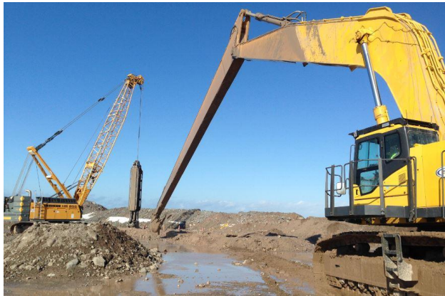
Figure 3. Initial procedure included a single excavator and a single clamshell

excavation conditions would be difficult and in order to reduce the chances of downtime, pre-drilling of the entire alignment down to 24 m below grade using a large caisson drill fitted with a 0.75 m auger/bit was planned. Although this drill would be expected to refuse on competent boulders and/or bedrock, it was still included to loosen cobble and gravel layers. In areas with rock layers or boulders, the plan was to move the alignment to avoid the troublesome area. In the event that the area could not be avoided, a drop chisel was planned for crushing boulders and for breaking other rock. In this case, the broken rock, boulders, etc. could then be removed using the excavator or clamshell. The drill used to pre-drill the alignment was also planned to be available to pre-drill locations deeper than 24 m, if necessary. Similar SCB slurry trench installation approaches to those proposed for use at this site had been used successfully used in difficult soil conditions and the pre-drilling/drop chisel contingencies were included to further increase the chances of success.