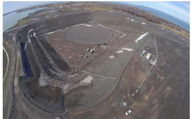
Figure 10. Aerial photo of the completed graving dock. (Dexter Construction Co, 2015).

The SCB cutoff wall was ultimately installed in accordance with the project objectives. Upon completion of the cutoff wall, the excavation and dewatering contractor for the graving dock noticed a substantial decrease in dewatering volume relative to the estimated volume indicating that the cutoff wall was working as well as or better than designed. Based on the geotechnical and groundwater flow studies conducted for the dewatering system design prior to construction, it was anticipated that 80 deep well pumps with a 10 L/sec capacity would be required to maintain water levels below the graving dock floor after installation of the cutoff wall. After installation of the cutoff wall only 24 of the 80 pumps were necessary to maintain water levels below the graving dock floor indicating that the cutoff wall not only met but far exceeded the design intent.